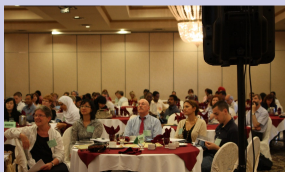
North Etobicoke LIP partners at the summit