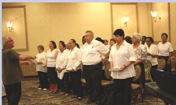
National Anthem, Ethno Cultural Seniors Program Choir Group