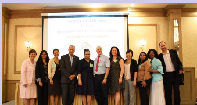
North Etobicoke LIP staff with some Partnership Council members